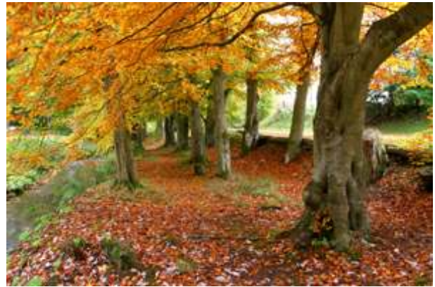
Autumn in the Den