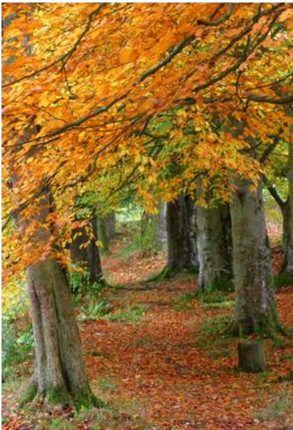
Autumn in the Den