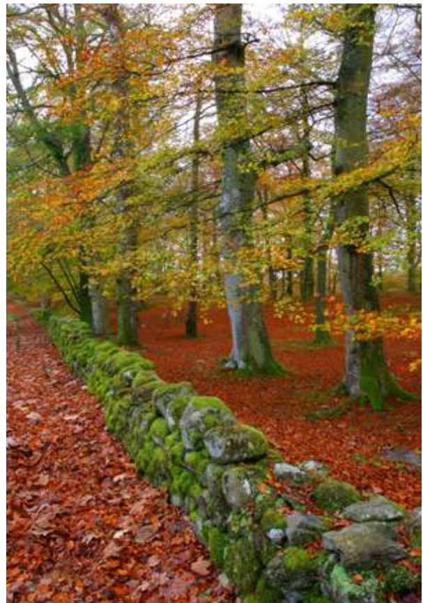
Autumn in Glenesk