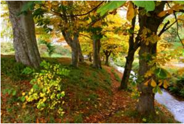
Autumn in the Den