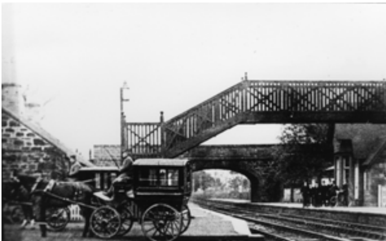
An early picture of Fordoun Station in the days of horse and carriage transport.